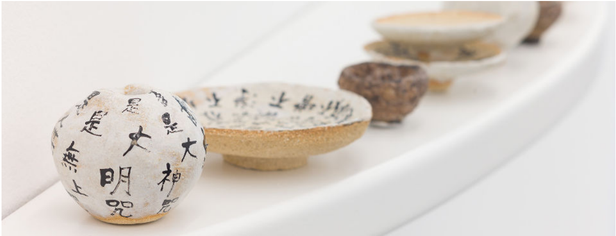
Charwei Tsai, Interbeing II , 2022 (detail)

Under the Same Sky —Charwei Tsai's third solo exhibition at mor charpentier— offers a comprehensive overview of her artistic practice, which closely intertwines art and spirituality through the elements that make her work so unique: a transdisciplinary approach combining drawing, sculpture, video, and photography.