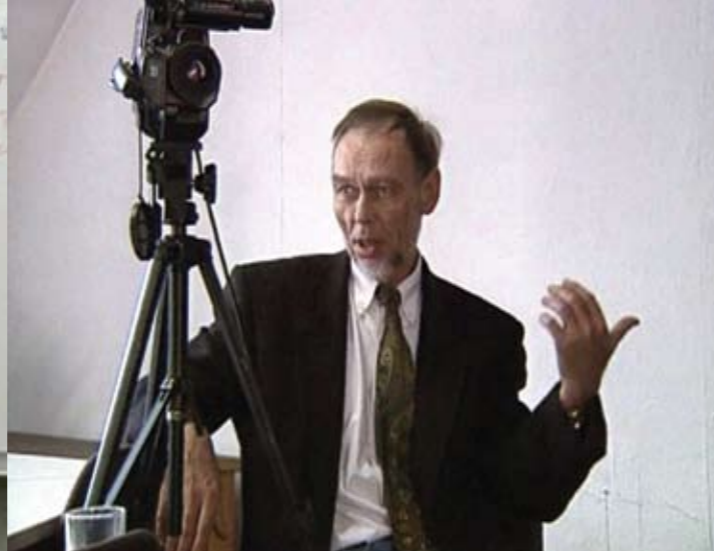
~ photo courtesy of the artist & galerie thaddaeus ropac, paris, france