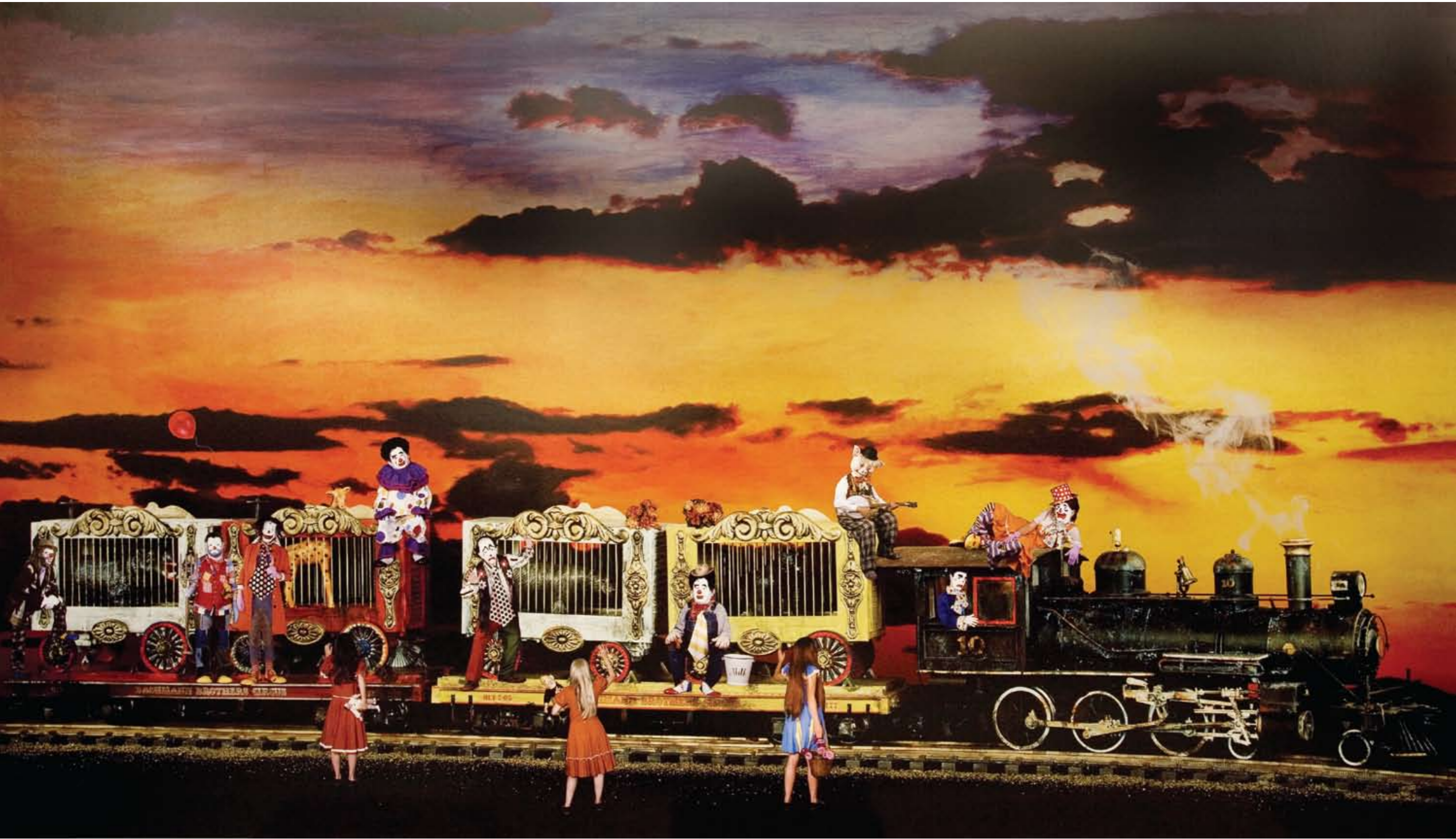
~ marnie weber, the arrival of the circus clowns , 2008