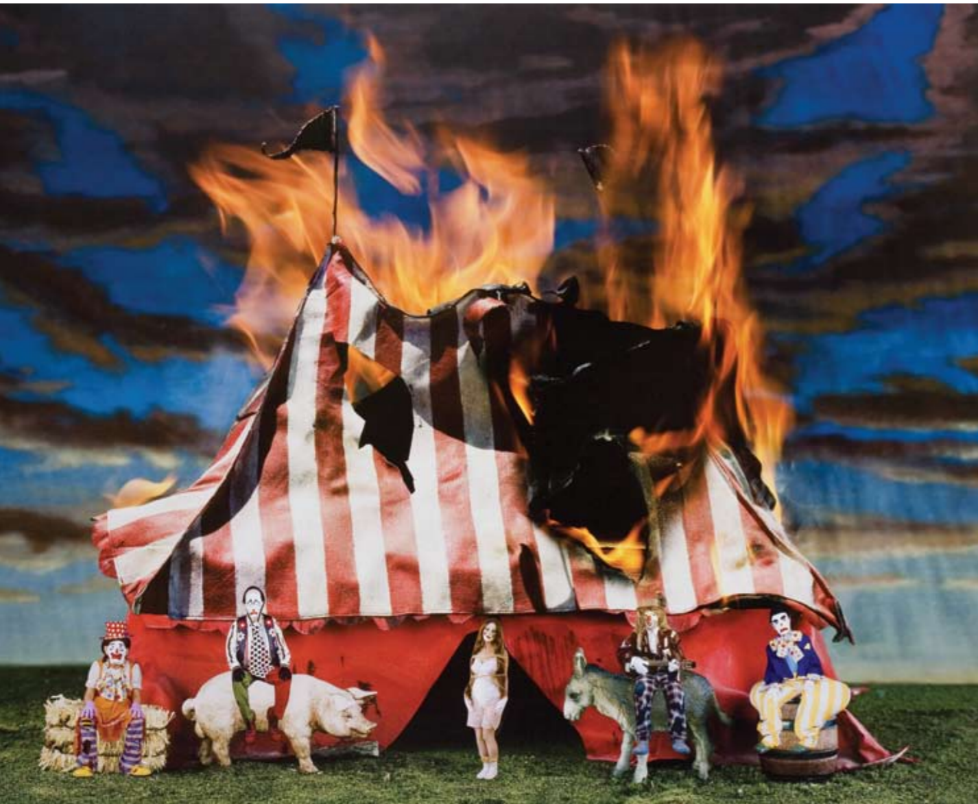
~ collage by marnie weber, melancholy elephants , 2008